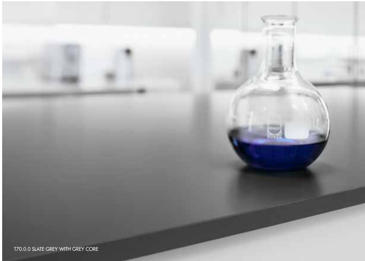
T70.0.0 SLATE GREY WITH GREY CORE