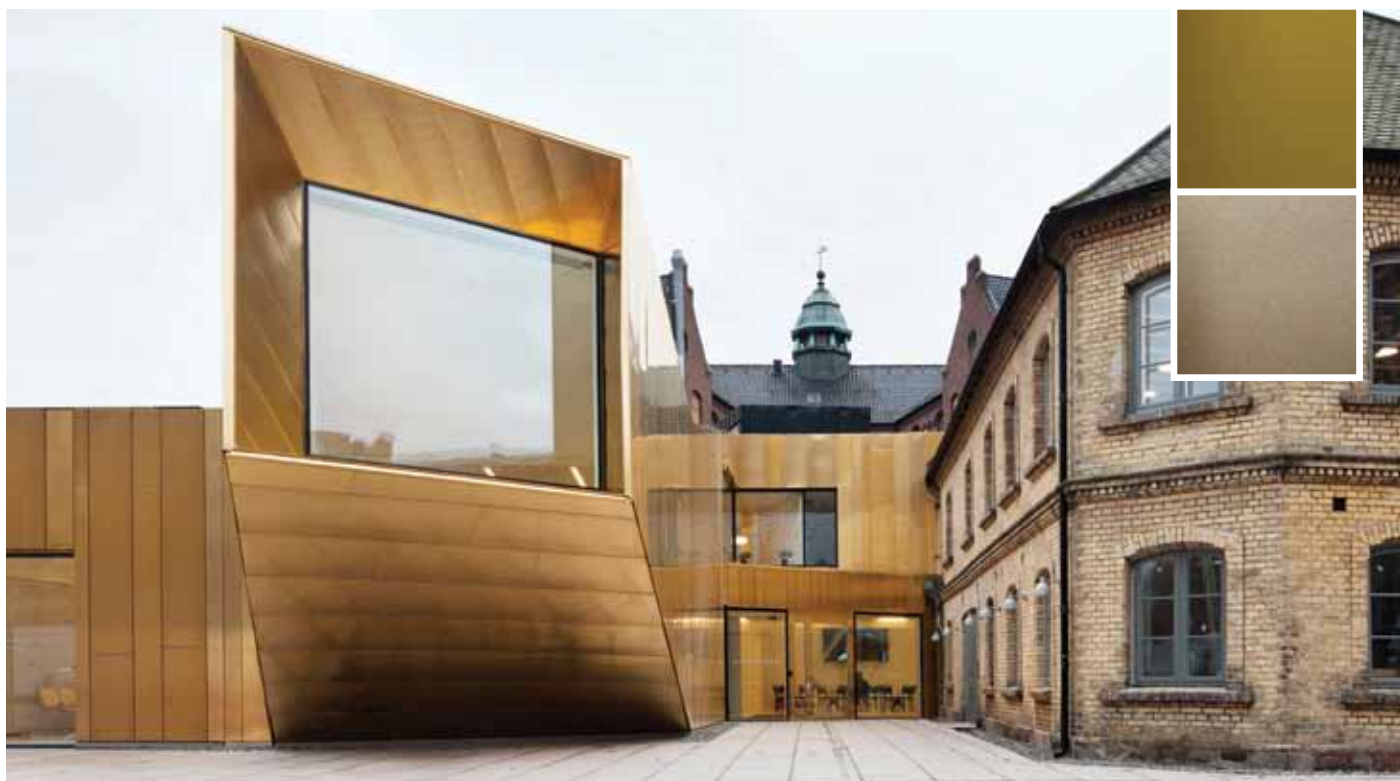
Lund Cathedral Visitor Centre, Sweden; Architect: Carmen Izquierdo.